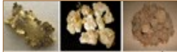
Gold Frankincense Myrrh

were given the privilege of being led to him and to worship him. He is our king and we are part of the wonderful world that he came to save.”