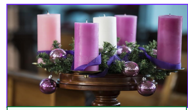
"I am the Alpha and the Omega, said the Lord God, who is and who was and who is to come, the Almighty."