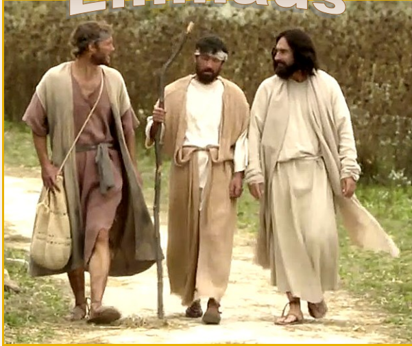
“After The Resurrection”

“He said to them, ‘How foolish you are, and how slow to believe all that the prophets have spoken! Did not the Messiah have to suffer these things and then enter his glory?’ And beginning with Moses and all the Prophets, he explained to them what was said in all the Scriptures concerning himself.”