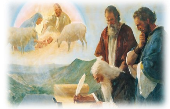
An artist's perception of Isaiah writing the prophecy of Christ's birth.

In Isaiah 7:14 we are told that the Lord would give a sign and that this Savior would be born of a virgin and he would